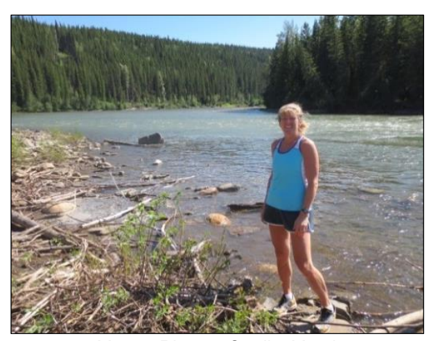
Murray River at Quality Mouth