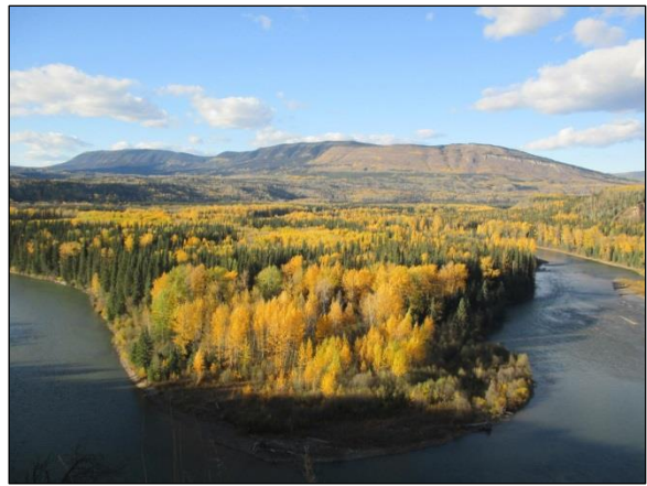
View of Murray River from Tumbler Point Trail