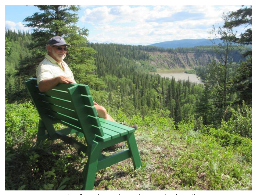
View from the Hoult Bench on Nathan's Trail

Before reaching the golf course parking lot, the trail leads along the edge of a terrace, with outstanding views of the Murray River below and the foothills in the distance. There is a bench from which to enjoy the view. This section of the TR Trail is known as Nathan's Trail.