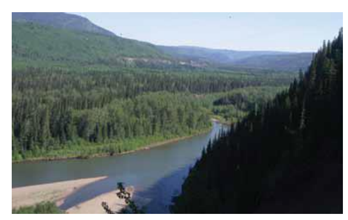
Final Viewpoint of the Murray River

The final viewpoint (km 24.6) at the end of а spur off Escher's Loop offers a bench that overlooks the valley as the Murray River courses northwards. It is two days by canoe to the next through bridge, pristine wilderness, magnificent а canyon, and