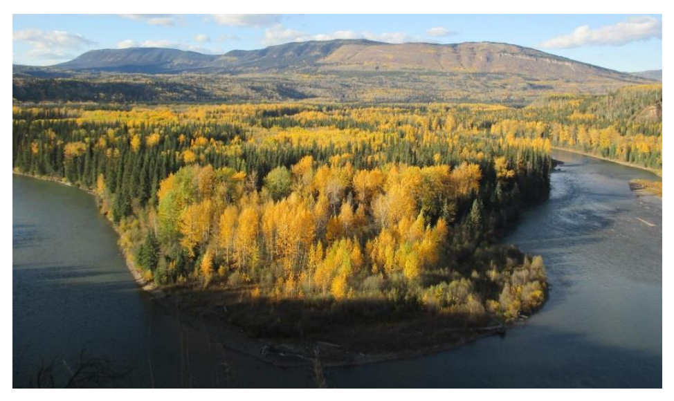
View from the Tumbler Point Trail

North-facing slopes are usually moist and thickly vegetated, but this is not the case at the <u>Murray River viewpoint</u> (km 15.9). The Murray River is actively washing away at the thick sands and gravels that form the river bank, and slides and small rockfalls are common. This explains why the trail avoids the edge here, as it is unstable, especially in spring at times of repeated freeze