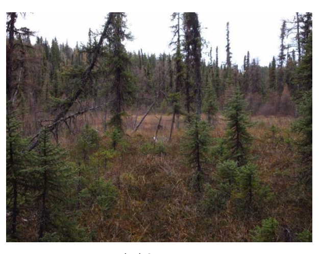
Black Spruce Bog

The trail skirts around an area logged by the Tumbler Ridge Community Forest in 2016 (km 27.5). This