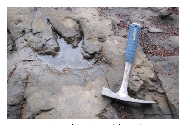
Theropod Footprint at Cabin Pool

horizontal rock layers. The main overhanging rock is formed from the same thick sandstone bed that crossed the creek at Top Pool, and that are seen again at Flatbed Falls and the Mini Falls. Water depth varies from year to year. Some years it is safe to jump into the creek from one of the rocks upstream from the Overhanging Rock. Always check depth before jumping, and do not dive in.