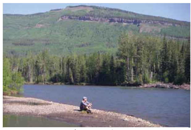
The Murray River

The second spur trail leads left to the Murray River (km 22.3). Here, as the river curves left. it encounters transition. For the past few kilometres it has through passed Pleistocene deposits from the last Ice Age, characterized by soft sediments and lt slumping. now