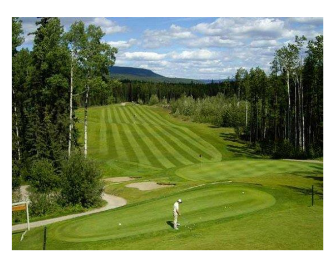
Tumbler Ridge Golf Course

The TR Trail follows some of the Wolverine Trail, built as cross country ski trails, before descending to Murray River via Larry's Trail. There are spurs to two riverside sites with views of the Bergeron Cliffs, then it climbs up the WNMS Lost Haven Cabin up Linda's Trail (the roughest and most challenging section of the TR Trail).