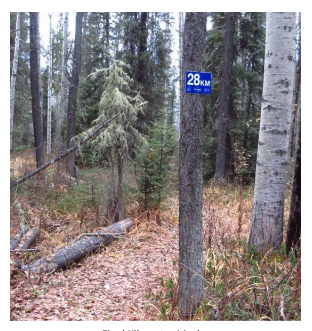
Final Kilometre Marker

Finally, the last kilometre marker is seen (km 28.0), and the end of the trail is reached behind the ball diamonds.