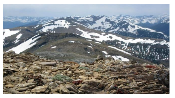
View from the summit