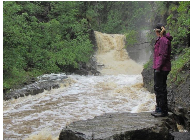
Quality Creek in Flood For more information, contact: