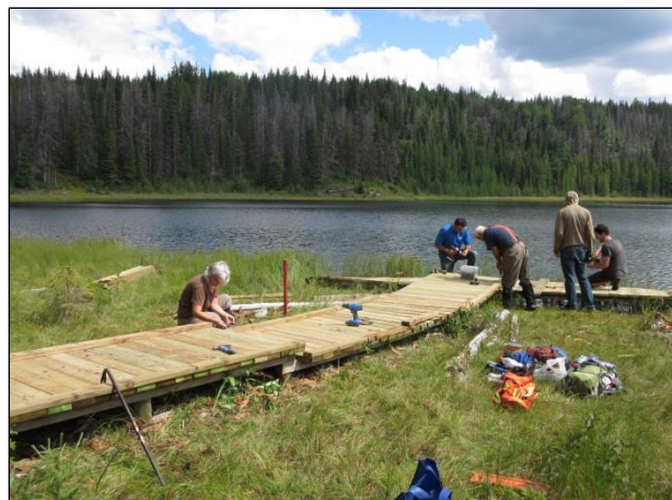
Volunteers building the dock at Irene Lake