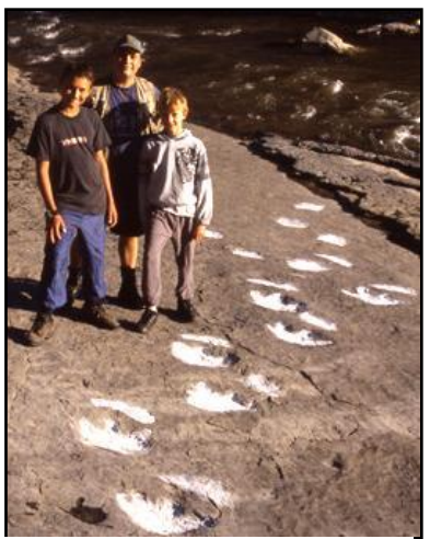
Original trackway discovered in 2000