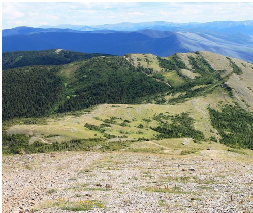
The infamous Onion Lake Trail

This trail is not for the faint of heart and requires above average riding skills. Due to the difficulty of the trail and the time required (10-12 hrs return), it is best attempted in small groups of 3-5 machines, after July 1 st to avoid snowpack in the alpine areas.